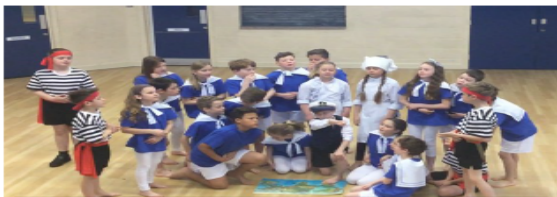
The children working hard in school during dress rehearsals.

of the building and were sharing with St Nicholas and St Anne's. It was a small space but everyone managed to squash in and get changed (very quickly!)